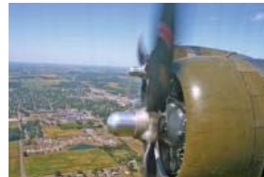
Aluminum Overcast, the Experimental Aircraft Association's B-17G Flying Fortress bomber, flies over Garrett during the plane's stop at the DeKalb County Airport in Sept. 2008. The plane will return to DeKalb County Sept. 25-27.