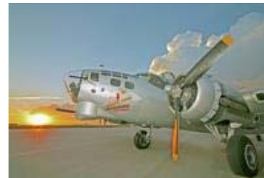
PHOTO CONTRIBUTED This publicity shot supplied by the Experimental Aircraft Association shows its World War II-era B-17 Flying Fortress bomber, Aluminum Overcast. The plane will be at the DeKalb County Airport Sept. 25-27, and the EAA will sell ground tours and short flights in the plane.