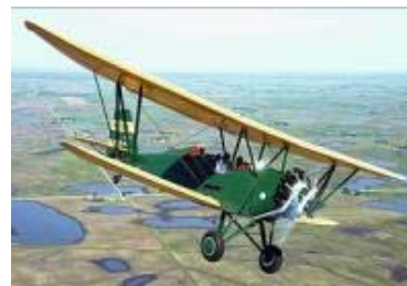
PHOTO CONTRIBUTED A fully restored 1942 New Standard D-25 biplane will be offering rides in Auburn Sept. 4-6.