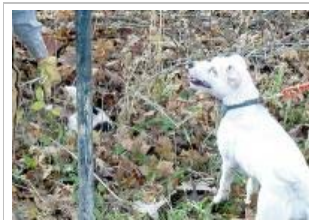
A Jack Russell terrier looks on as another is released into a groundhog burrow. While no groundhogs were found, the terriers located three opossums living underneath the airport. Airport manager Russ Couchman said the opossums were allowed to stay.