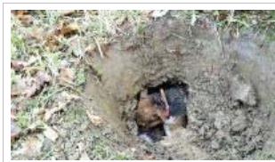
A Jack Russell terrier is located by searchers after sniffing out an opossum on the grounds of the DeKalb County Airport. The dogs are bred to hunt and eradicate groundhogs and other underground vermin by being lowered into burrows and dug out once a pest is found.

“It’s a pretty hefty system, and it would be pretty expensive to have to find where a problem is